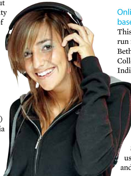
INDIA IS MOBILE New media brings gospel-opportunities